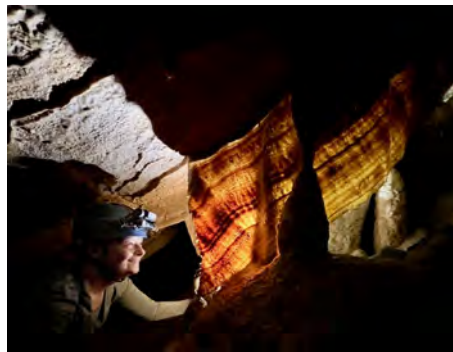
Patton Cave Aug 2025 by Brian Williams

Patton Cave has over 5000' of passage and makes for a nice grotto trip. Lots of places to get lost in, some areas of nice formations, big rooms, high leads, mud slopes, breakdown mountains, active stream passage, high leads, exposure—it's all there.