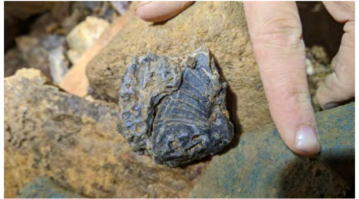
Fossil Cephalopod (Dave Socky)

The right-hand passage was against the right wall and split into an upper and lower level. Both levels ended in breakdown or mud fill after only 30 feet. That was not the way to go. The left-hand