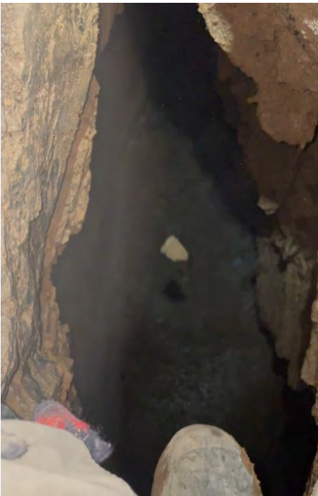
A small rock dropped down the pit (Mia Blyseth)

As we worked, we filled up the floor in the walking canyon passage preceding the dig. We passed the larger rocks from person to person, but for smaller rocks we used a bucket. By the end of the day, we had raised the floor close to a couple