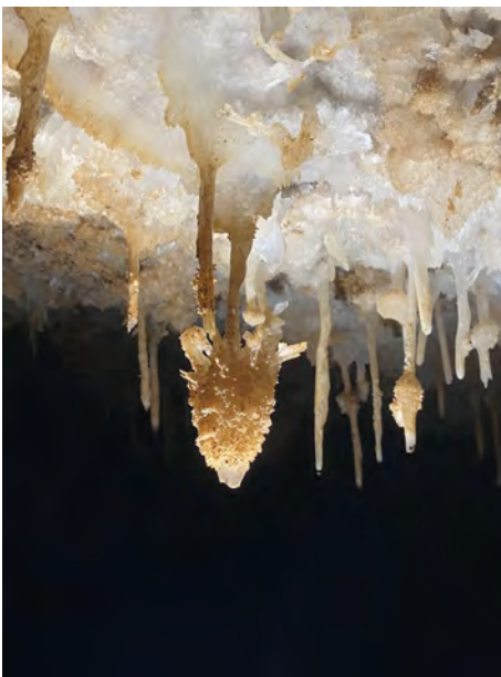
Pretty formations in Wishing Well Cave.