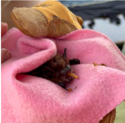
Koda enjoying a mealworm

The Blue Ridge Grotto held a Cave Day event at Dixie Caverns, VA on June 6, 2026. The day included many brochures, pamphlets, and info on caves and caving, including a squeeze box for the kids (and adults!). The biggest draw, though, was ambassadors Koda and Beatrice, both non-releasable female Big Brown Bats from the Southwest Virginia Wildlife Center of Roanoke. Below are some of the photos taken during this very successful event.