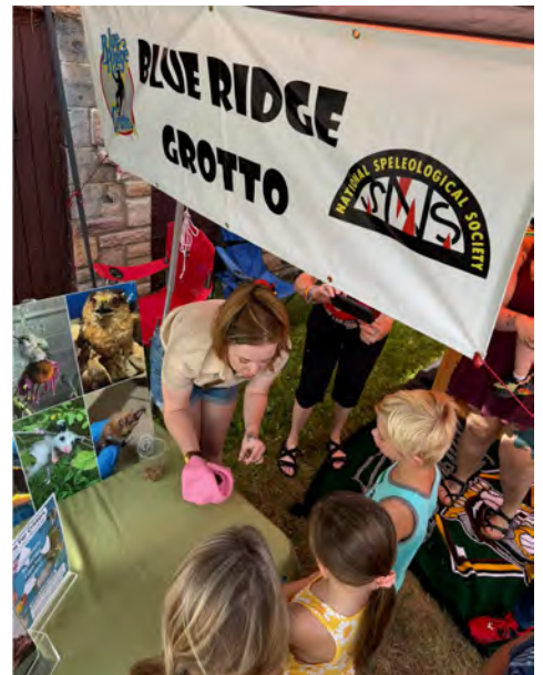
Kids are fascinated by Koda. (Jeff Huffman)