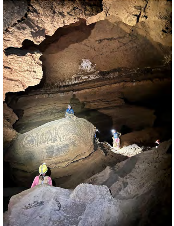
Echo Junction.

Overall it was a really good cave trip. It was a new cave for everyone but myself. We got to see some really nice formations and hang out with good friends.