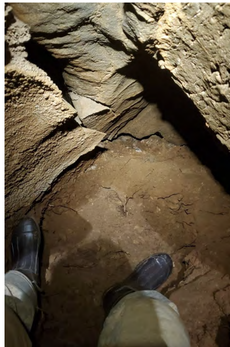
The dig face on 4/2.