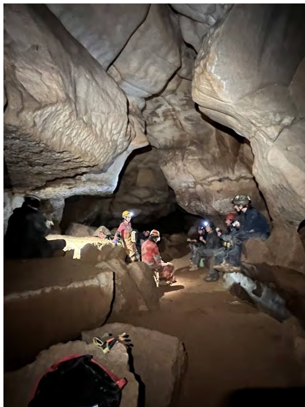
The group taking a break in Rapps Cave.

After exploring the entrance section and taking many pictures we headed into the cave. We stopped and explored around the section with lots of pretty formations. Next we headed further