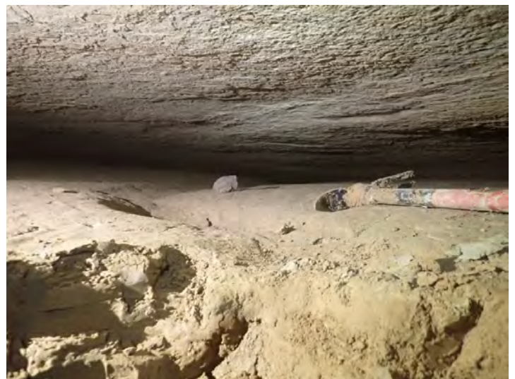
The pancake room and dry water course (Yvonne Droms)