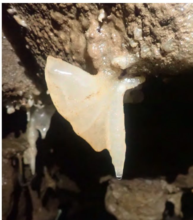
Paxton's Butterfly Formation.

Good fun trip with lots of stuff to see.