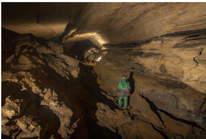
The main passage between RCC35 and BSF9

Continuing along the right-hand wall, we got into a side breakdown passage with holes to a lower level, which connected back into the main passage, but there were leads down there too. At BSF13 was a breakdown lead which goes low