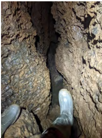
View of pool of water from rope.