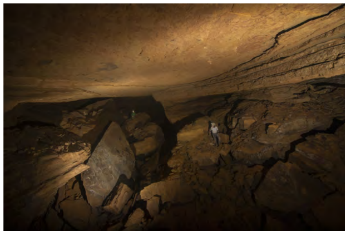
breakdown lead at BSF13 is behind the caver in the back