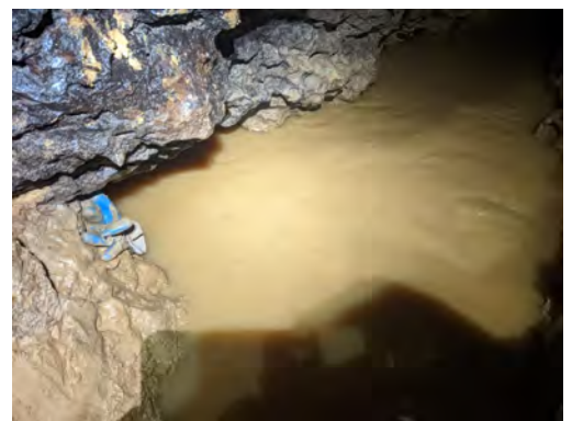
Water welling up at upstream end.