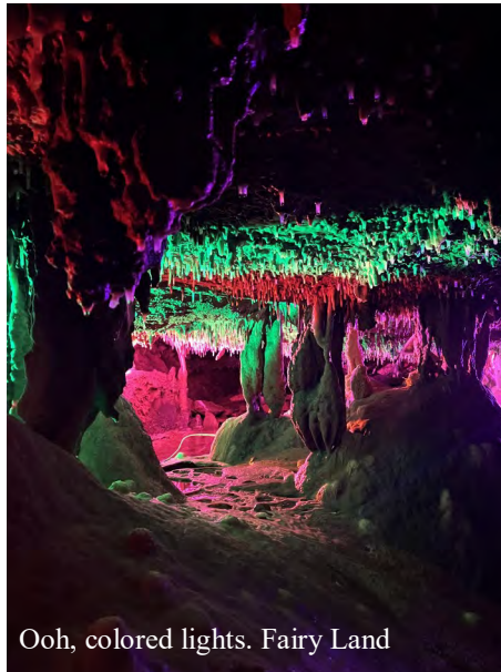
Ooh, colored lights. Fairy Land